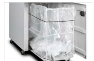
ADJUSTABLE REMOVABLE TROLLEY

It eliminates the need to manually lubricate the unit, ensuring maximum reliability, efficiency and capacity.